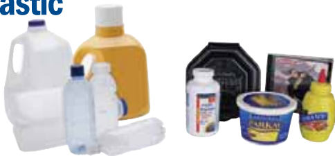
Plastic Jugs/Bottles/Household Plastic Empty containers only