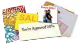
Office Paper & Junk Mail Envelopes, Flyers, Brochures, Postcards, etc.