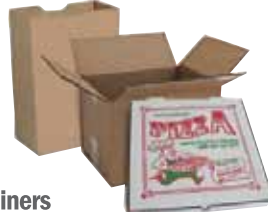
Cardboard, Pizza Boxes & Paper Bags

Flatten cardboard & cut into pieces. Remove wax paper from pizza boxes