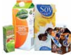
Food & Beverage Containers Empty containers only