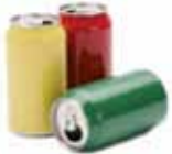
Aluminum Cans Empty cans only