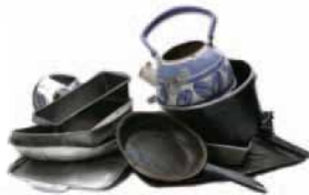
Kitchen Cookware Metal pots, pans, tins & utensils