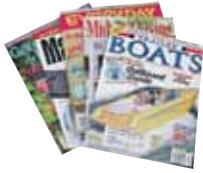
Magazines & Catalogs All types & sizes