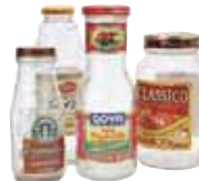
Empty & Clear Bottles & Jars Only